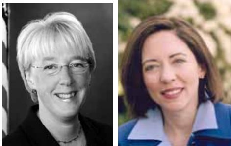
Senators Patty Murray and Maria Cantwell

Senators Patty Murray and Maria Cantwell joined 27 other Democratic senators in signing a “Dear Colleague” letter opposing any cuts in Social Security as part of a deficit reduction package.