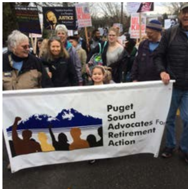
The PSARA crew at MLK Day