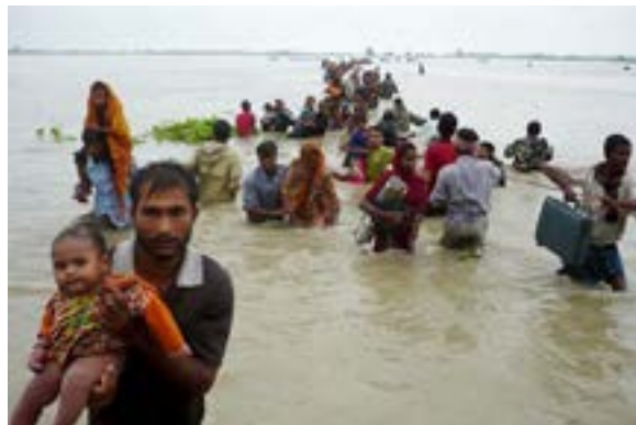
Still from the film "Climate Refugees" Alessandro Grassani

The world has warmed to 1.2 degrees over pre-industrial levels and we are now close to the 1.5 degrees long-term goal set by the Paris Agreement (although the nations' commitments under the Agreement will allow global temperatures to exceed 3 degrees by 2100).